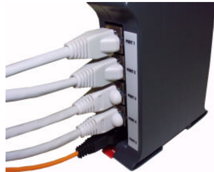
Figure 7. RJ45 and MTRJ cables on 3570A-1F

Insert the MTRJ plug on your fiber cable into an MTRJ jack on the 3570A. Push the plug into the jack until the plug clicks into place. To remove the plug, simply depress the latching tab and pull the plug out of the jack.