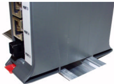
Figure 3. Attaching the 3570A to the DIN rail

To remove the unit, insert a screwdriver into the red tab and pry the tab outward until the lock is released, then rotate the unit upward and lift off.