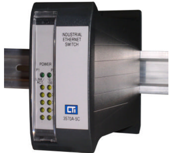
Figure 1. 3570A Front Panel

The 3570A Series of 5-port Industrial Ethernet Switches from CTI is designed specifically for providing network access to small clusters of factory floor equipment. In addition to its ability to withstand harsh production requirements, the 3570A Series includes features like spacesaver DIN rail mounting and redundant power supply connection which make it even easier to integrate into a typical industrial installation.