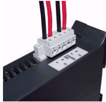
Figure 6. Dual Power Supply Wiring