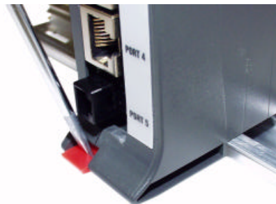
Figure 4. Removing the 3570A from the DIN rail