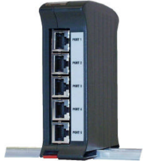
Figure 2. RJ45 Ethernet Ports on 3570A-5C

All ports are IEEE802.3 compliant, and RJ45 ports include auto-negotiation, auto-sensing, and auto-crossover. This allows connection of any Ethernet device without worrying about speed, cable rollover, or full/half duplex. The switch automatically detects the characteristics of the attached device/cable and sets up its port accordingly.