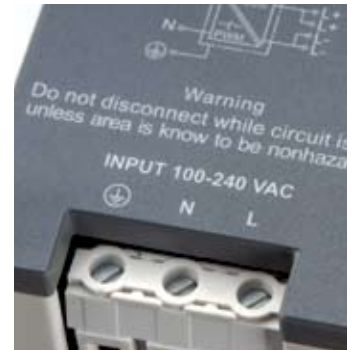
Wide input range

The 24 V units of the CP-E range, offer a transistor output for monitoring and remote diagnosis.