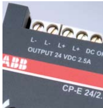
“DC OK” output

The 24 V units of the CP-E range, offer a transistor output for monitoring and remote diagnosis.