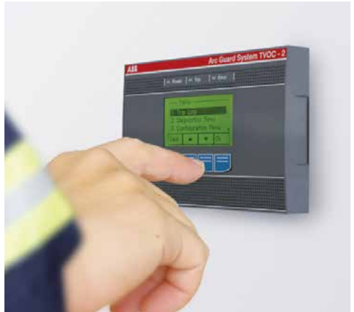
Human Machine Interface

To fit your application, we have added functionality to trip up to 3 breakers. If required, various selectivity can be applied depending on which sensor has triggered.