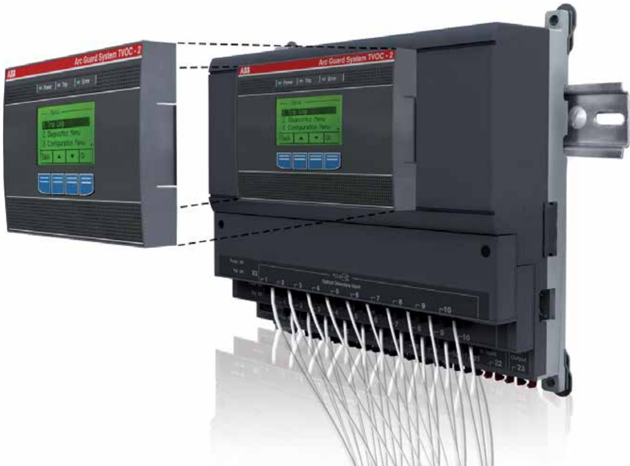
TVOC-2 showing the possibility to put HMI (Human Machine Interface) mounted on a panel-door.

A reliable, simple and flexible solution for your business safety.