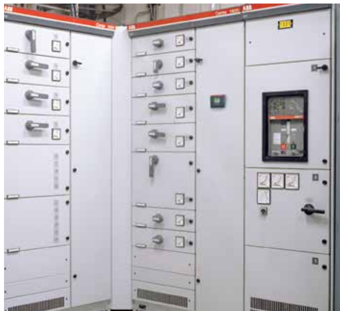
Arc Guard System™ – TVOC-2 installed in an ABB Low Voltage Switchgear

Using TVOC-2 means that you can meet the highest safety requirements! For example, NFPA70E, a US standard for the safe installation of electrical wiring and equipment, states: “a flash hazard analysis shall be done in order to protect personnel from the possibility of being injured by an arc flash. The analysis shall determine the Flash Protection Boundary and the personal protective equipment that people within the Flash Protection Boundary shall use.” With Arc Guard System™, these calculations will show that the energy from an arc flash is decreased to an extent that reduces the need for additional protection. Note that the requirements for functional safety ensure the reliability of the figures used in these analyses.