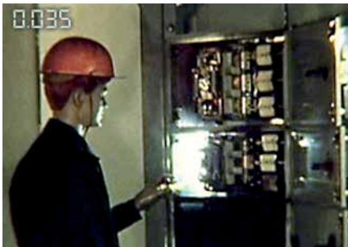
With ArcGuard System™