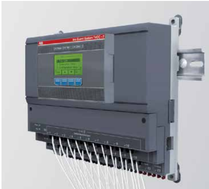
TVOC-2 mounted on DIN-rail