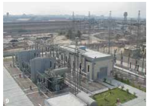
1 Cruise ship | 2 Oil rig | 3 Chemical industry | 4 Train | 5 Hospital | 6 Steel industry | 7 Wind power | 8 Papermill | 9 Substations

Arc Guard can be used almost anywhere there's a need to detect strong light.