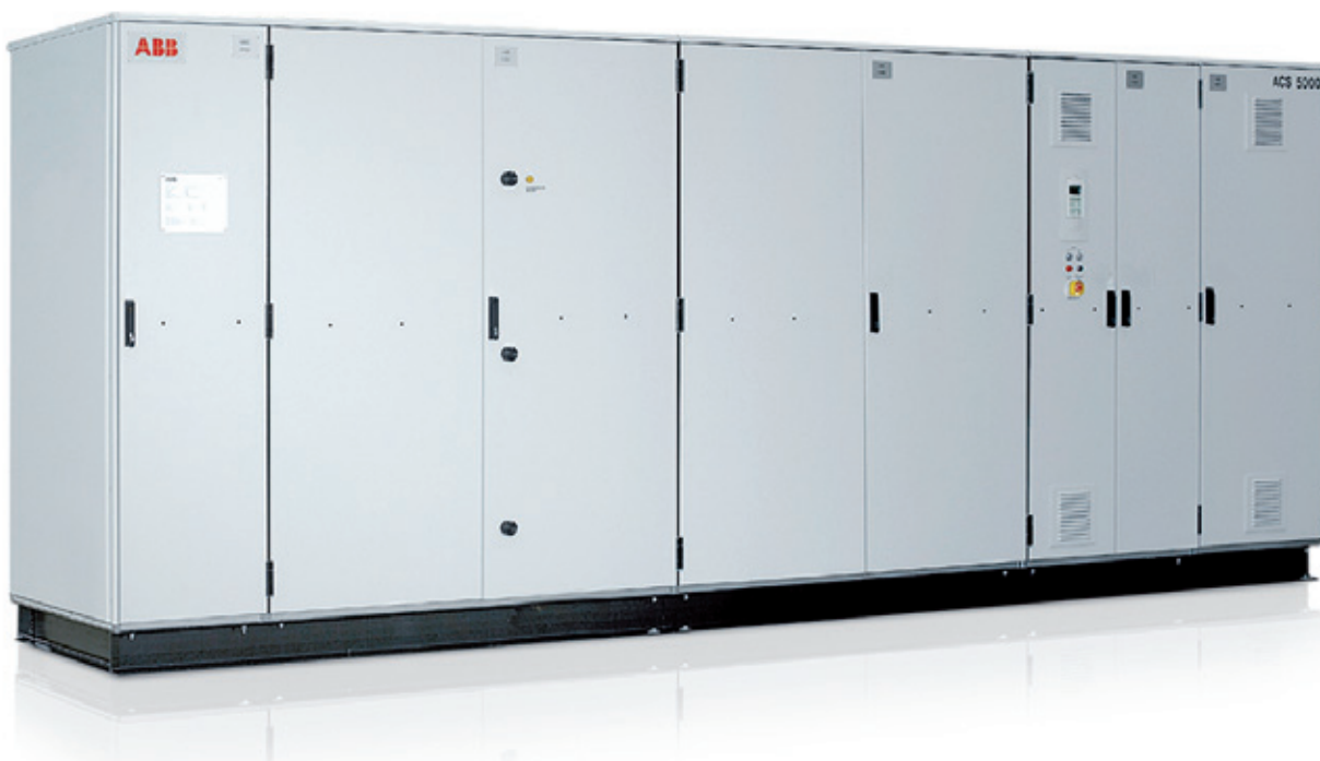
ABB also supplies high speed VSDs for compressors. The combination of a high speed VSD and motor means that the motor can be coupled direct to the compressor without the need for a gearbox. This compact solution reduces maintenance requirements and noise levels and provides considerably higher availability than a conventional solution using a step-up gearbox.

ABB medium voltage drives provide powerful and accurate control of compressor applications. They are available in the power range 315 kW - 100 MW and can be used with induction, synchronous and permanent magnet motors. Compared to mechanical control methods, ABB's electric variable speed drives offer many advantages, including increased availability, better control, and improvements in overall energy efficiency, operational flexibility and maintainability.