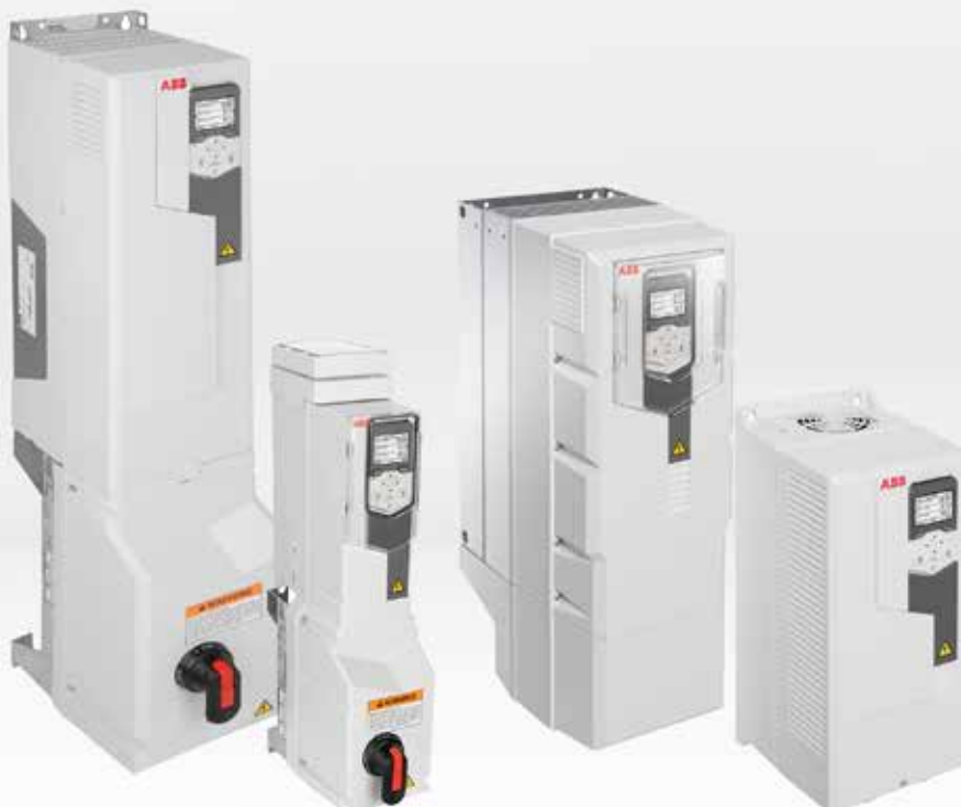
ABB general purpose drives ACS580, 1 to 700 hp