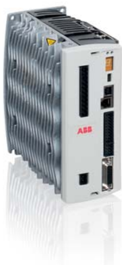
Compact motion control drive with embedded safety and EtherCAT® technology