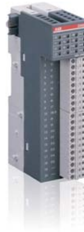
Flexible I/O modules for the cost-efficient AC500-eCo PLC