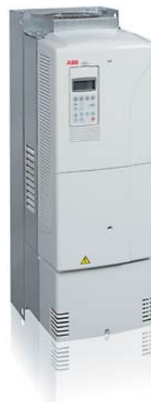
Complete regenerative drives in a compact package