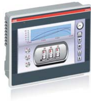
Human-machine interface for efficient process control and monitoring