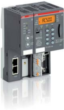
PLC module for even the most demanding of conditions