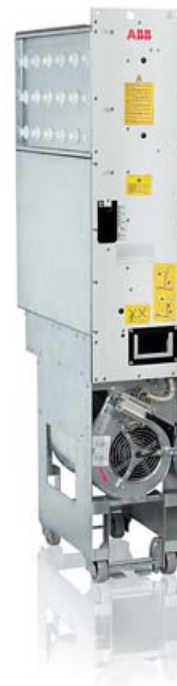
Drive modules with regenerative supply for energy savings