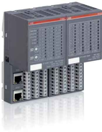
Flexible I/O modules for the powerful AC500 PLC