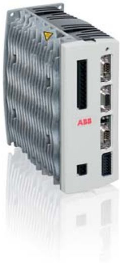
Compact motion control drive for simple applications