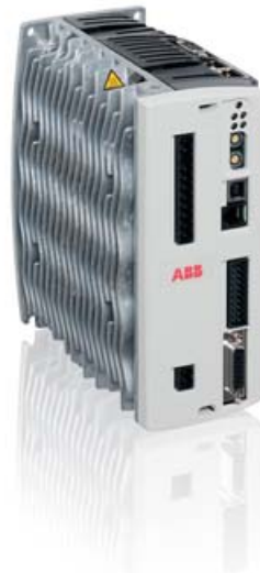
Compact motion control drive with real time Ethernet technology