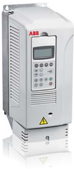
Wall-mounted industrial drives with everything built-in