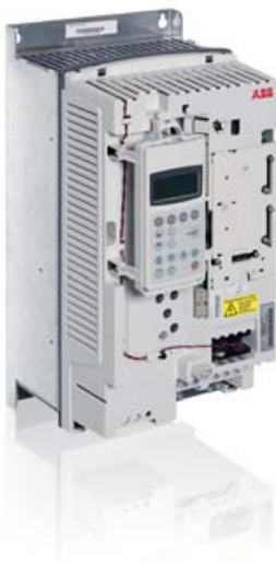
Compact drive modules optimized for cabinet assembly