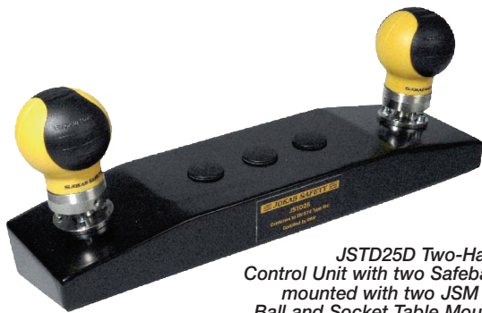
JSTD25D Two-Hand Control Unit with two Safeballs mounted with two JSM C5 Ball and Socket Table Mounts