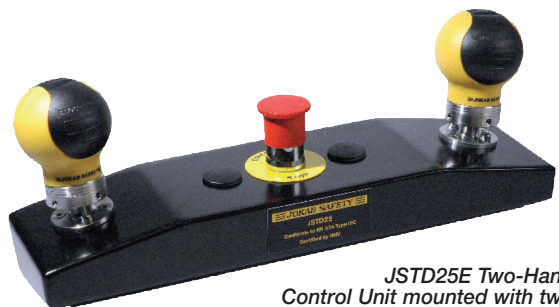
JSTD25E Two-Hand Control Unit mounted with two JSM C5 Ball and Socket Table Mounted Safeballs and Emergency Stop Button