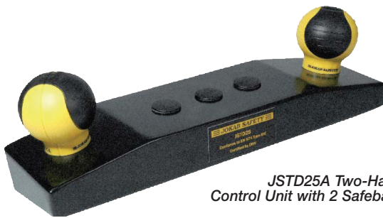
JSTD25A Two-Hand Control Unit with 2 Safeballs

lamps. A hatch is supplied for wire routing in the base and securing holes for mounting on the rear. The Safeballs are connected to terminal blocks for the user to connect the external wiring through one of the two inlet alternatives (underneath or at the rear).