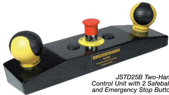
JSTD25B Two-Hand Control Unit with 2 Safeballs and Emergency Stop Button