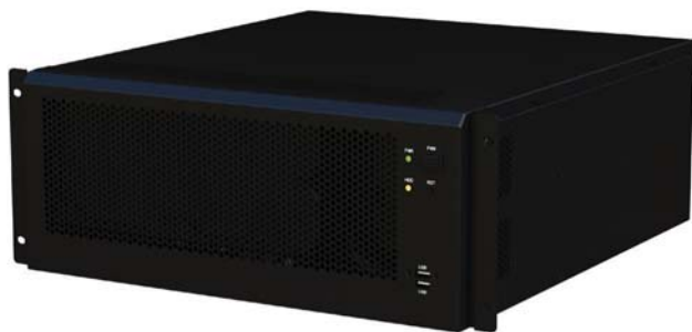
RS - 4607 AT - Q351