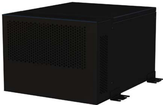
BoxPC - 480Q