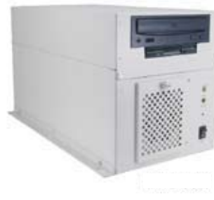
MPC - 1060