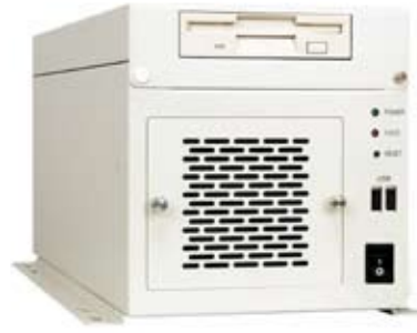
MPC - 1061