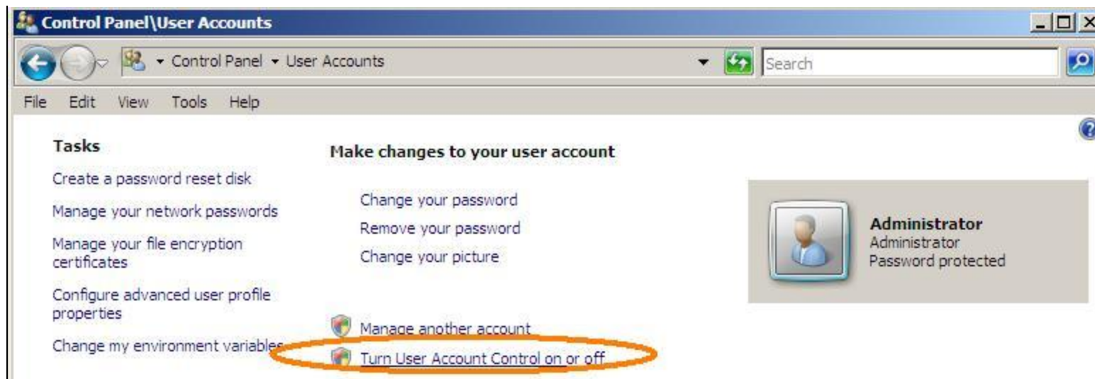
FIGURE 2: TURN USER ACCOUNT ON OR OFF