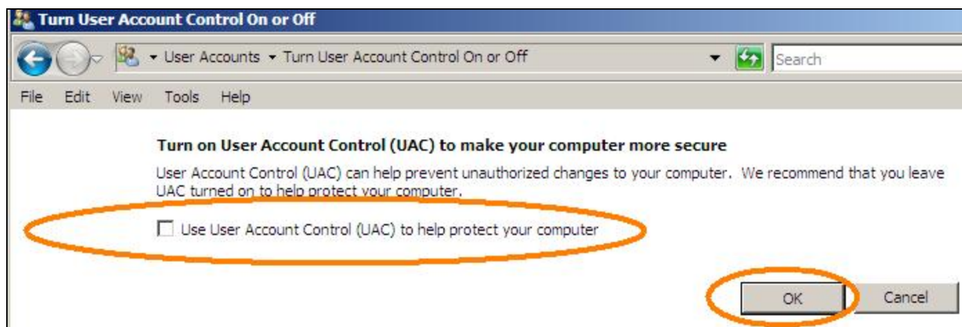
FIGURE 3: UNCHECK USER ACCOUNT CONTROL OPTION