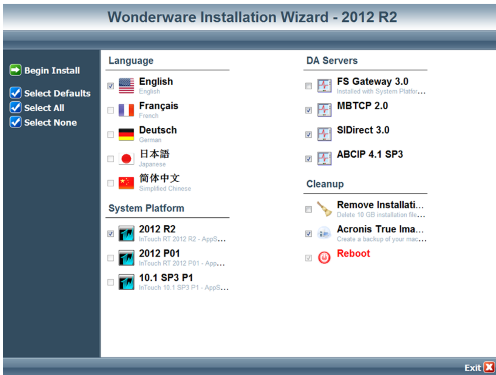
FIGURE 2: WONDERWARE INSTALLATION WIZARD ON WINDOWS 7