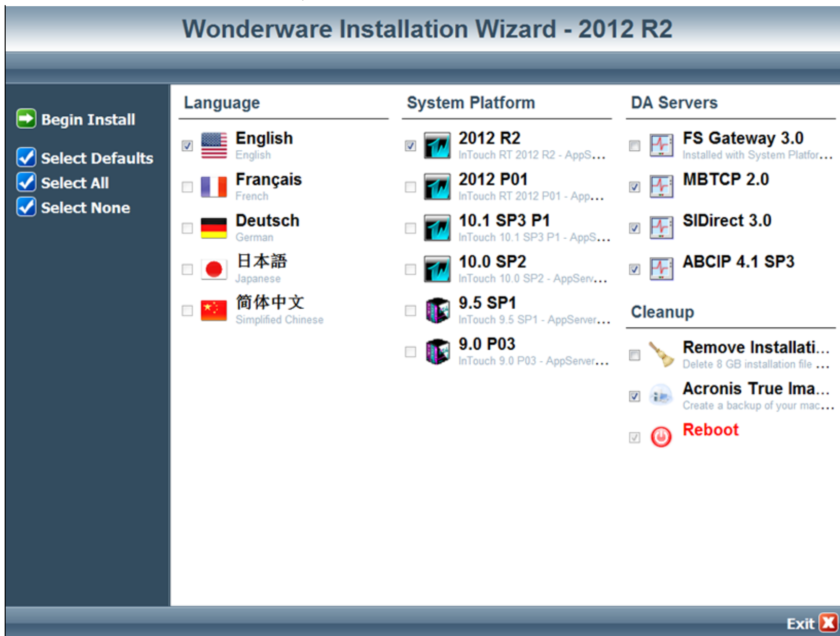
FIGURE 1: WONDERWARE INSTALLATION WIZARD ON WINDOWS XP