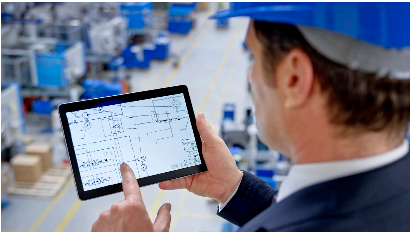
Expanding Plant Floor Visibility And Unlimited Web Access