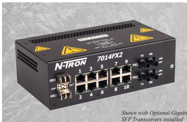
Shown with Optional Gigabit SFP Transceivers installed

Port Mirroring - This function allows the traffic on one port to be duplicated and sent to a designated mirror port. Port mirroring can be used to monitor Ethernet traffic on the designated source port using the assigned mirror port. In addition, SNMP, COM port, and Telnet interfaces are available for switch link and status monitoring.