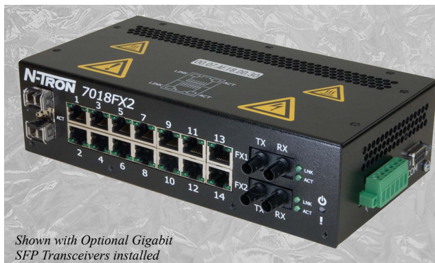
Shown with Optional Gigabit SFP Transceivers installed

DHCP -DHCP Server/Client automates the assignment of IP addresses. DHCP Option 82 assures that if a device on a specific port is replaced, the replacement receives the same IP address as the original device.