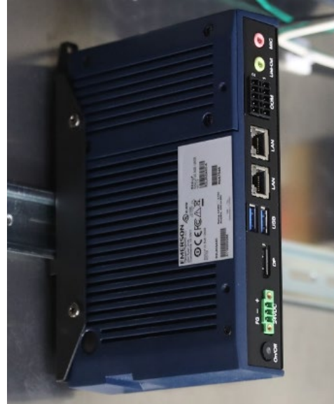
DIN Rail Mounted RXi2 - LP Industrial PC