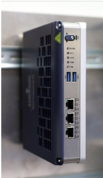
DIN Rail Mounted RXi2 - BP Industrial PC