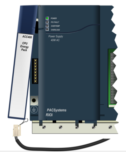
Figure 2: Module Installation