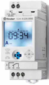
1 CO (SPDT) 16 A