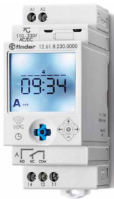
1 CO (SPDT) 16 A

Applications: Municipal lighting (street, squares, monuments, fountains...), gardens, parking, shops, illuminated signs, irrigation systems, heating and cooling plant.