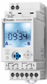
2 CO (DPDT) 16 A