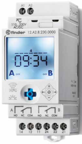
2 CO (DPDT) 16 A