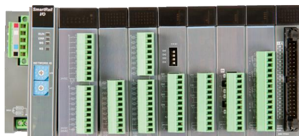
HE599COS100, with 8 I/O modules installed.

Modules can be added either before or after the CNX100 base has been installed on the DIN-rail.