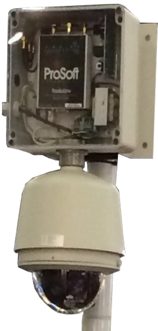
An IVC wireless PTZ camera with an integrated ProSoft Technology radio.

An IVC-based solution was delivered by systems integrator REM. REM chose to implement the wireless network infrastructure using radio products from ProSoft Technologies. The deployed system provided the customer with a cohesive, wireless video monitoring solution with a single point of contact for design, delivery, and installation. IVC's Relay Server camera management software provides system administrators a web-based interface for camera and system configuration, user management, and storage management.