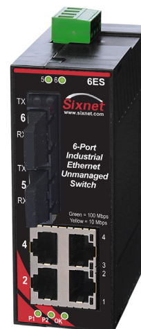
SL-6ES-4/5 Lexan Case Standard Temperature