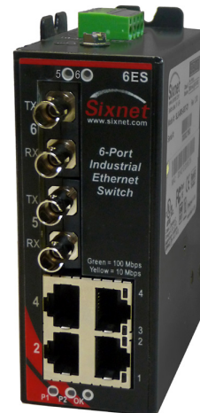
SLX-6ES-4/5 Aluminum Case Wide Temperature

We have been designing industrial hardware such as Remote Terminal Units for over 30+ years and have used this expertise to design the toughest Ethernet switches on the market. Don't trust your critical communications to so-called industrial hardware from commercial switch manufacturers. Sixnet switches give you proven assurance that your system will keep running for years to come.