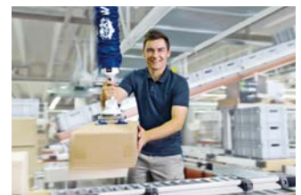
Lifting systems and cranes