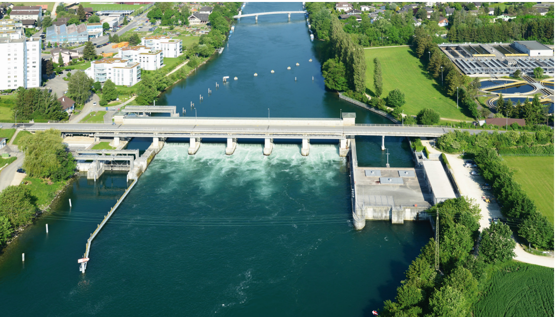
innovative automation technology at Port Brügg can now be used to provide greater protection for people and the local environment.