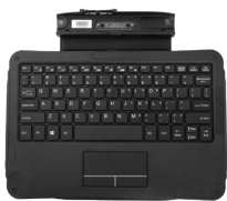
Companion Keyboard & KickStrap