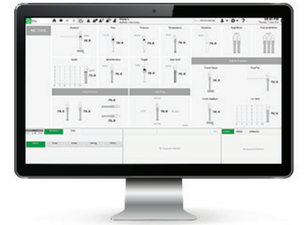
Library of Configurable Objects