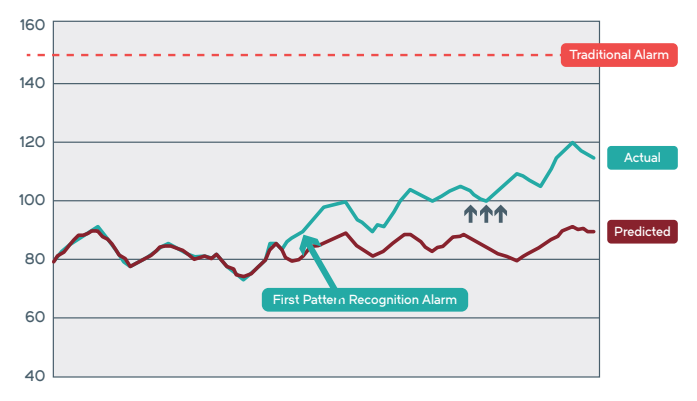
Predictive Asset Analytics makes it easy to identify anomalies and provides notification of abnormal conditions before operational alarms.

Predictive Asset Analytics uses a proprietary algorithm called OPTiCS that uses Advanced Pattern Recognition (APR) and machine learning technology. For systems with lower levels of historical repeatability, high noise, or process driven systems, Predictive Asset Analytics uses a plugin for a predictive algorithm called KANN. This algorithm allows user to create models that predict future values for signals. The algorithm uses artificial neural network technology and allows users to create operational profiles with a specific set of inputs and outputs and to test how the outputs will evolve in the future through data playback.