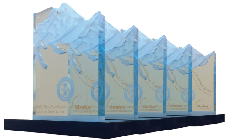
5x Northface Scoreboard Award winner for exemplary customer service