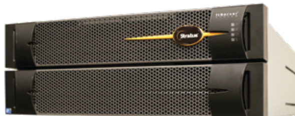
Figure 4. Advanced edge platforms, such as the Stratus ftServer platform, provide scalability, extensibility and standardization. The best Edge Computing platforms scale well as new nodes and locations are added.

The best Edge Computing platforms scale well as new nodes and locations are added. They are extendable to accommodate new operations and control capabilities without a significant investment, and flexible to extend monitoring and control of the plant to mobile devices.