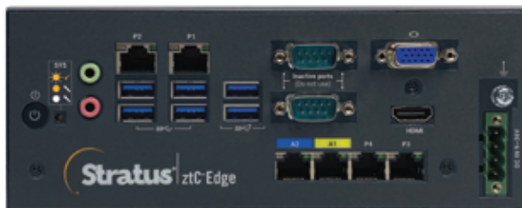
Figure 3. Some modern Edge Computing platforms are industrial grade, such as the ruggedized, Class I Division 2 (CID2) certified Stratus ztC Edge Computing platform, which can be installed in hazardous locations, with the PLCs, in the same control panel without special accommodations for temperature, humidity or vibration protection.

Scalability, extensibility, and standardization also are associated with advanced edge platforms, such as the smaller-capacity Stratus ztC Edge and large-capacity Stratus ftServer® platforms (see Figure 4 ).