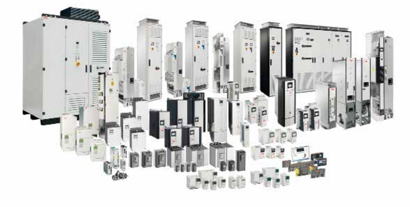
ABB compact drives, part of the most extensive drives and softstarters portfolio in the world